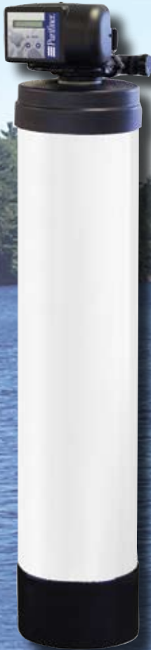
Shown With 2400 Valve And Optional Bypass Valve