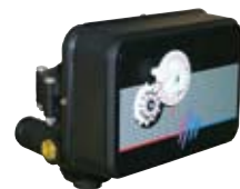
568 ROTARY CONTROL